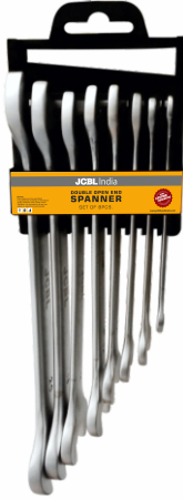
Vertical Compact Plastic Hanger Combination Spanner S/o 6, S/s 8, S/o 12 Pcs.