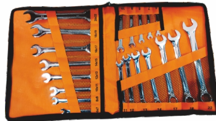
Tool Kit 20 Pcs.