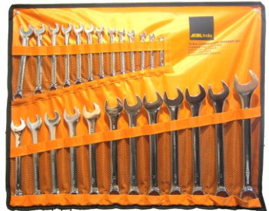
Tetron Kit Roll with net pockets