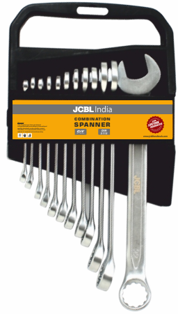
Vertical Plastic Hanger for D.O.E, Combination & Ring Spanner S/o 6, S/s 8, S/o 12 Pcs.