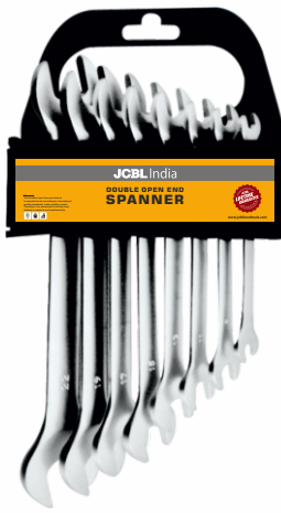
Vertical Plastic Hanger for D.O.E, Spanner S/o 6, S/s 8, S/o 12 Pcs.