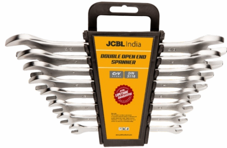
Vertical Plastic Hanger for D.O.E, Combination & Ring Spanner S/o 6, S/s 8, S/o 12 Pcs.