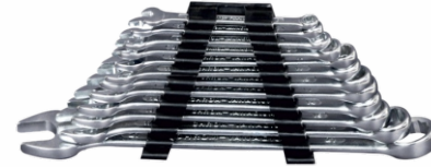
Plastic Clip for D.O.E & Combination Spanner S/o 6, S/o 8 Pcs