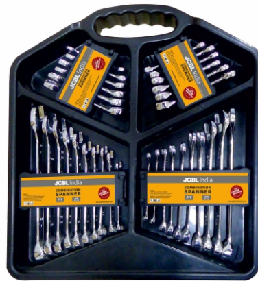
32 Pcs Plastic Tray