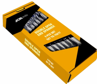
JCBL Brand Window Box