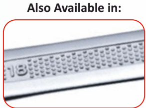
ANTI SKID PANEL

MOQ FOR BRAND ENGRAVING & FOR SAE SIZES ARE 3500 PC/SIZE*