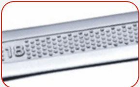
ANTI SKID PANEL