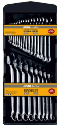
25 Pcs Plastic Tray