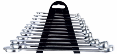
Plastic Clip for D.O.E & Combination Spanner S/o 6, S/o 8 Pcs