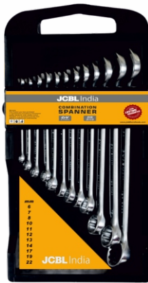
12 Pcs Plastic Tray